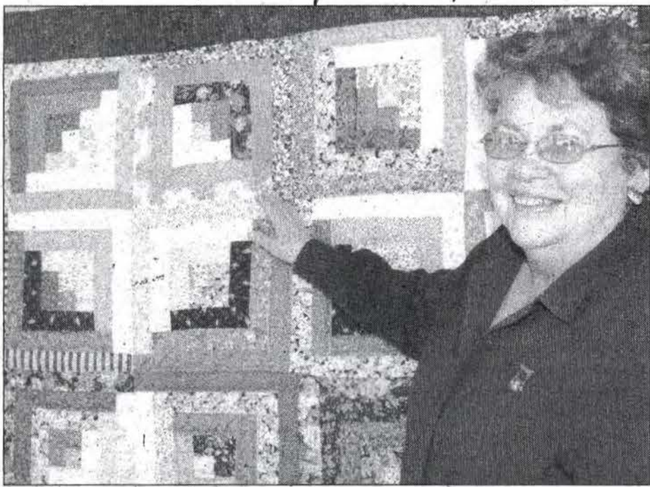
A beautiful quilt donated for charity.